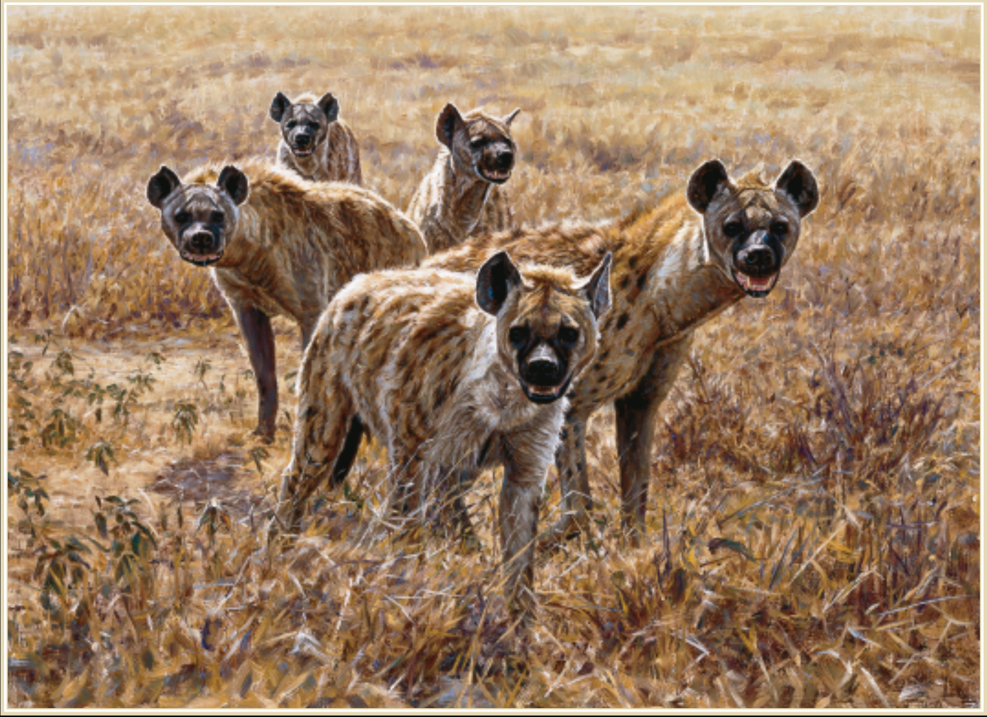
"Pirates of the plains"