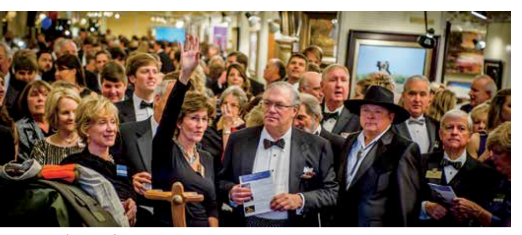
Art lovers at the Southeastern Wildlife Exposition preview gala live auction in 2015.

The Southeastern Wildlife Exposition welcomes artists and more for its 34<sup>th</sup> annual event celebrating nature.