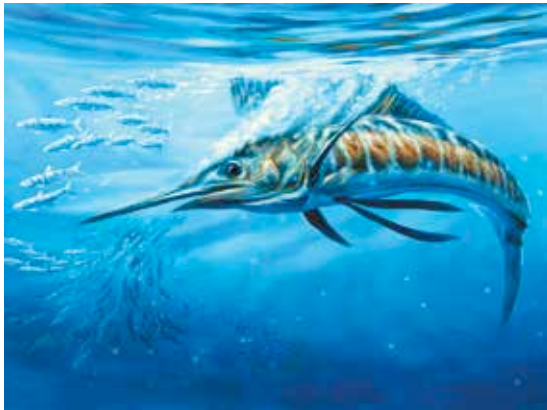
Guy Crittenden , Blue Bounty , oil on canvas, 24 x 36"

Southeastern Wildlife Exposition includes artist booths, conservation education and sporting demonstrations, as well as the Quick Draw/Speed Sculpt Friday, February 12 at